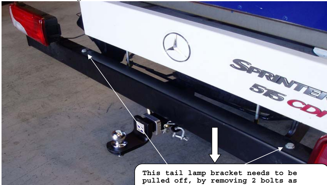
Fig 1: Vehicle with towbar fitted shown.

This tail lamp bracket needs to be pulled off, by removing 2 bolts as shown on the top face & 2 bolts at the bottom of the bracket.