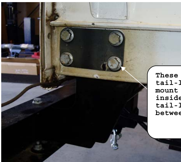
Fig 2 : Bolts used to mount the towbar shown.

These 4 bolts used to mount the tail-light bracket is also used to mount the Towbar Sidearms on the inside of the chassis, with the tail-light bracket sidearms in between.