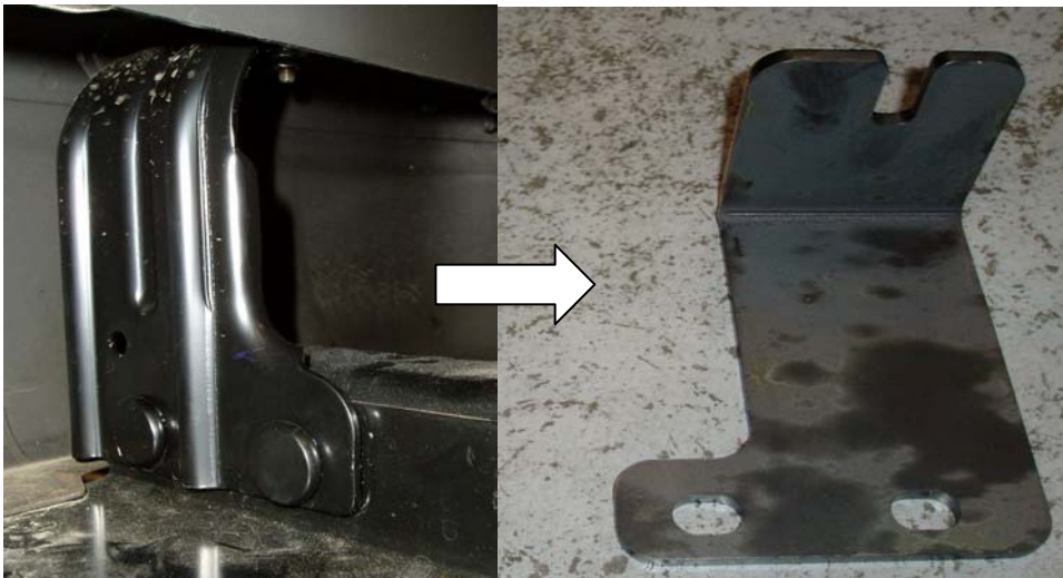
FIG 5: SHOWS THE MOUNTING BRACKETS & PACKER PLATES PROVIDED BEING FITTED ON THE STEP