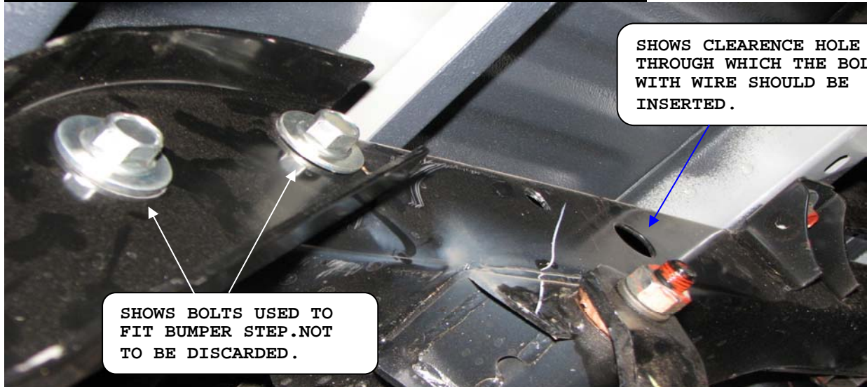
FIG 2: SHOWS BOLT HOLES THAT NEED TO BE SLOTTED.